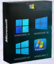
All Windows Versions