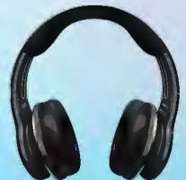
Headphones & speakers